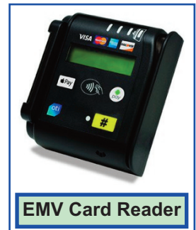
EMV Card Reader